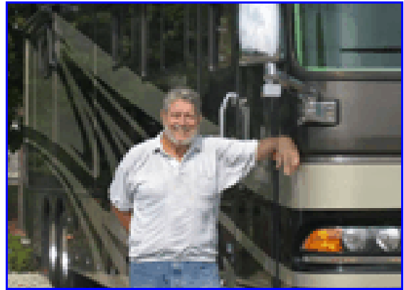
The Author & His Latest "Wheels"

We have a large motorhome. It looks fine. It is our home. It cost as much as a home. It is impressive to others. I am sure there are some people who think that because I have this very nice RV, I must have considerable wealth and carry it with me. I don't, but they don't know that.